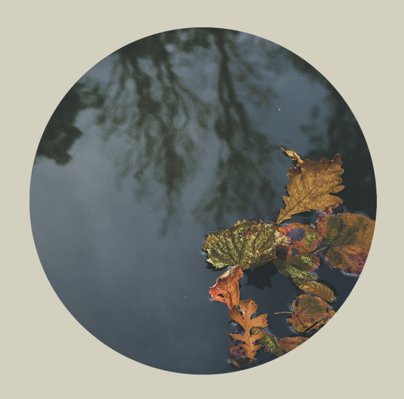
for GCF Nuvali's Prayer and Fasting Week FEBRUARY 17 to 24